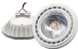
Ø 111 x 57 mm - 165 g