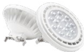
Ø 111 x 65 mm - 130 g