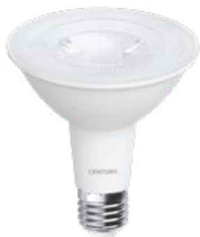
8 W - Ø 63 x 89 mm - 54 g 10 W - Ø 95 x 105 mm - 96 g 15 W - Ø 121 x 140 mm - 125 g