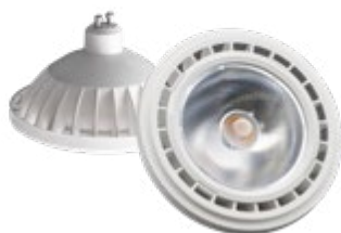
Ø 111 x 68 mm - 118 g